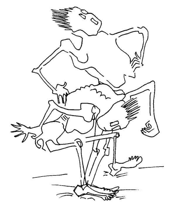
Figure 1 A full-blown, over-the-top, out-of-control Hairy Jamaica (Jay's description of an anorexic rage) – scary!

someone to stand up to her and to lay down the law – the Law of Reality, the Law of the Household. It may not be what she wants, just as a child wants everything its own way and will scream, tantrum and push as far as possible to achieve its short-term wants, but without any help toward some sort of control Anorexia will simply continue to destroy all around her with hostility and aggression.