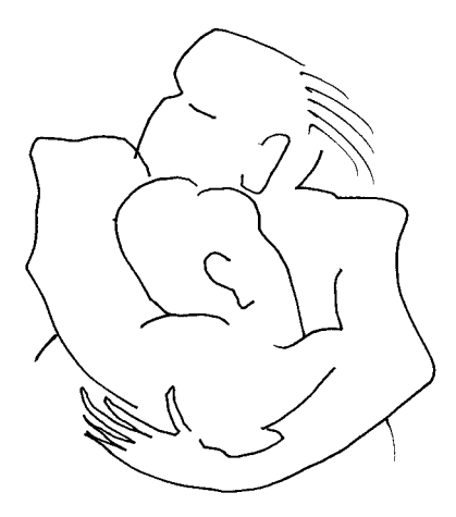
Figure 3 I don't like Anorexia's behaviour but I love you very much. I love you so much, that's why I worry about you. I only want the best for you ... I love you.